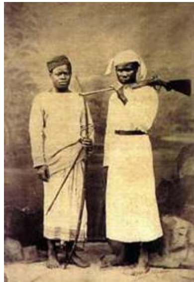
Sussi & Chuma

Resident wildlife, such as hippopotamus and elephant, is likely to wander through the Lodge grounds at any time, since in the National Park they have priority. A wide choice of activities adds to the attractions of this elegant, secluded retreat.